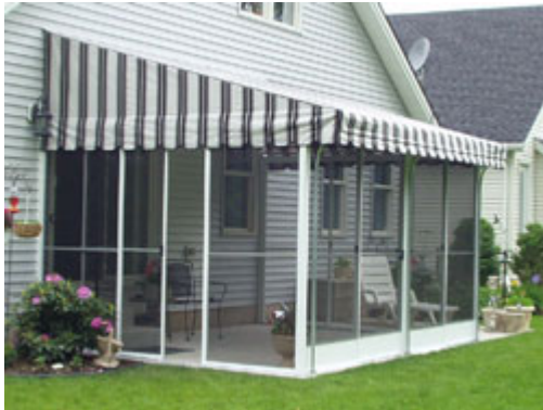
insect proofing in buildings

Use: It is widely used for air exchange and insect proofing in buildings, fields, gardens, vegetable sheds and other structures.