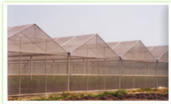
insect proofing in vegetable sheds